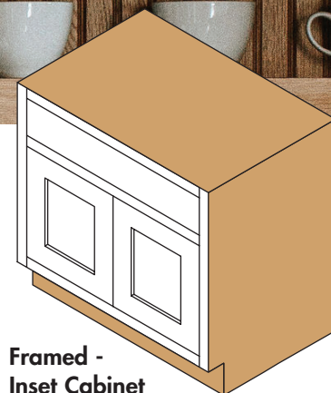
Framed - Inset Cabinet